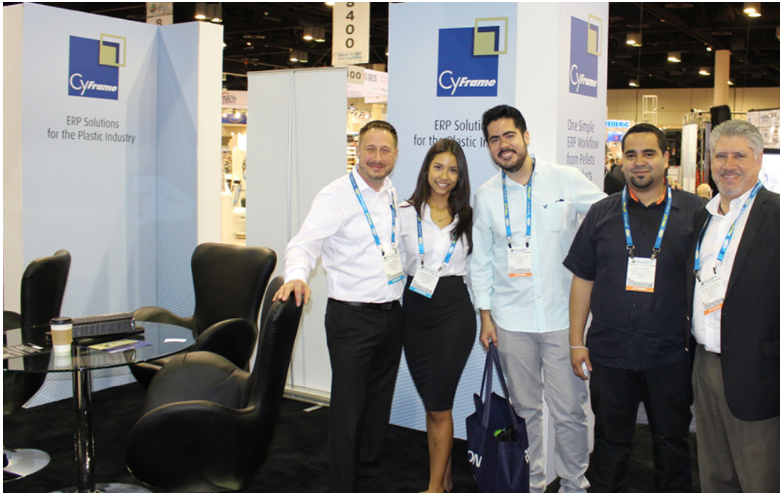
CyFrame at NPE Orlando 2015