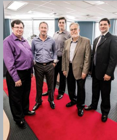
The Management Team

Best Small Business of 2015 Partners and Associations