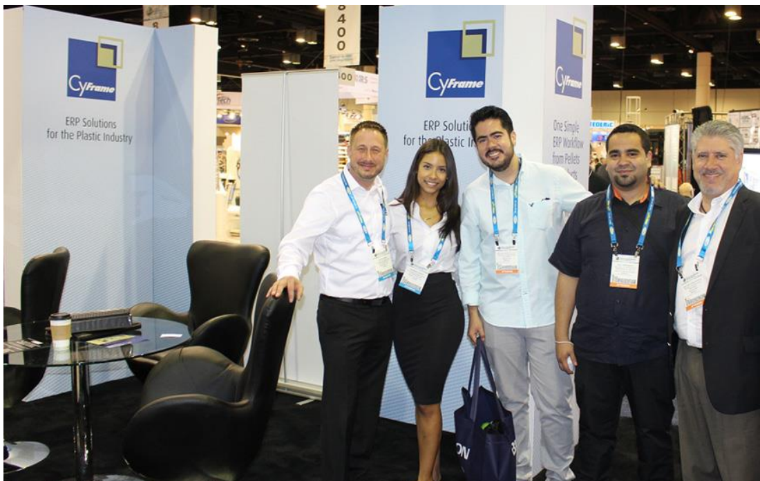
CyFrame at NPE Orlando 2015